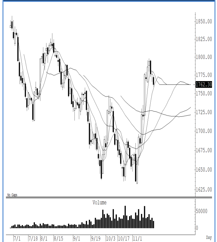
GOZ22 (Close 1,762.30 Chg -13.70)

ราคาทองคำโลกย่อตัวลงต่อเนื่อง สั้น ๆ ดึงกลับไม่ผ่านแถว ๆ 1,775 ดอลลาร์ แนวโน้มน่าจะย่อตัวลงต่อ แนะนำ trading ในกรอบระหว่าง 1,775-1,725 ดอลลาร์ ระวังกำไร ในกรณีที่ปิดต่ำกว่าระดับ 1,700 ดอลลาร์ แนะนำถือ short หวังผลปรับตัวลงไปแถว ๆ 1,680 ดอลลาร์ ระวังกำไร